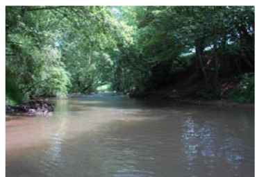
THE COUNTY BOUNDARY

Please respect the privacy of the residents of this private house as you continue through the property and into a field.