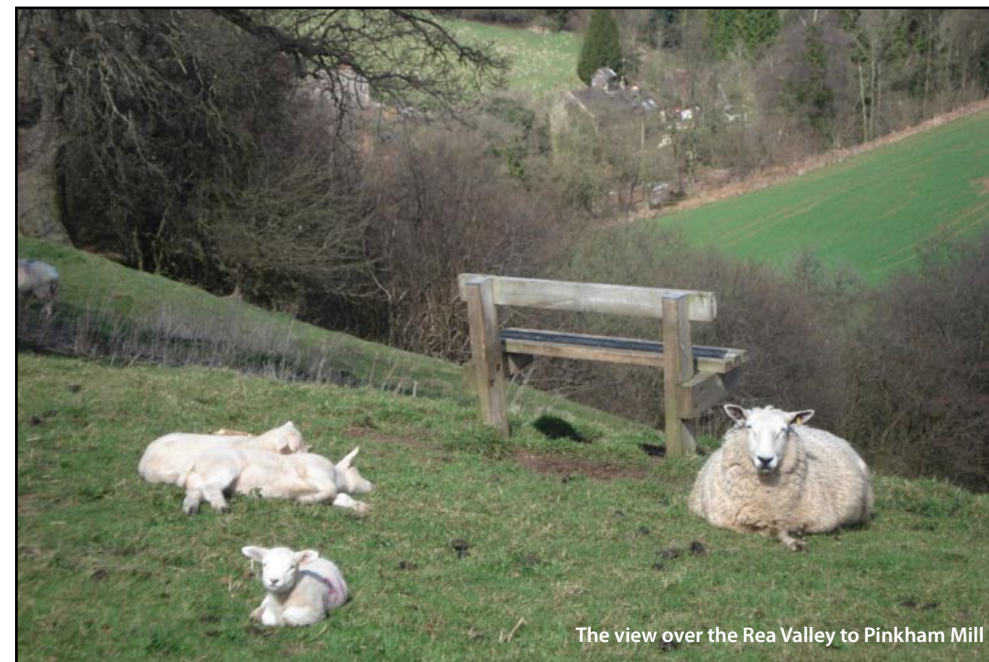
The view over the Rea Valley to Pinkham Mill

Note: Due to the terrain, nearly all our walks involve at least one short steep uphill and some stiles. However, you can take it as slowly as you like and the views make it worthwhile.