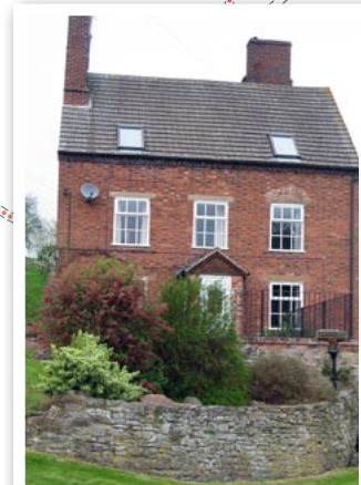
THE INN AT PINKHAM MILL