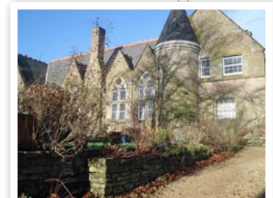
OLD INFANT SCHOOL