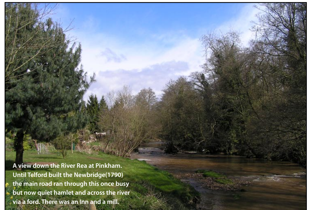
A view down the River Rea at Pinkham. Until Telford built the Newbridge(1790) the main road ran through this once busy but now quiet hamlet and across the river via a ford. There was an Inn and a mill.

Note: Due to the terrain, nearly all our walks involve at least one short steep uphill and some stiles. However, you can take it as slowly as you like and the views make it worthwhile.