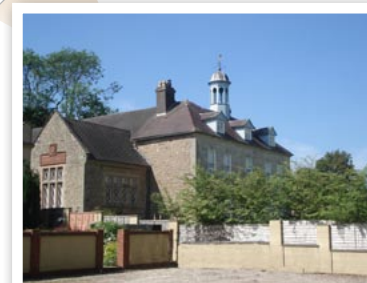
OLD JUNIOR SCHOOL