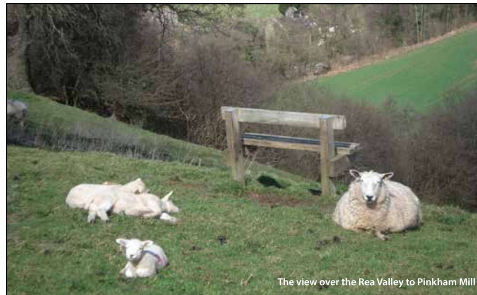
The view over the Rea Valley to Pinkham Mill

Mawley Hall and gardens is a private residence. Please respect this and keep to rights of way through the estate.