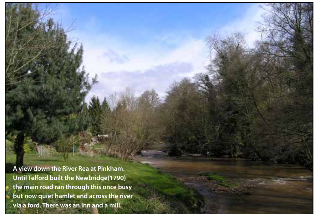
A view down the River Rea at Pinkham. Until Telford built the Newbridge(1790) the main road ran through this once busy but now quiet hamlet and across the river via a ford. There was an Inn and a mill.

Note: Due to the terrain, nearly all our walks involve at least one short steep uphill and some stiles. However, you can take it as slowly as you like and the views make it worthwhile.