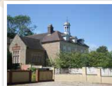
OLD JUNIOR SCHOOL