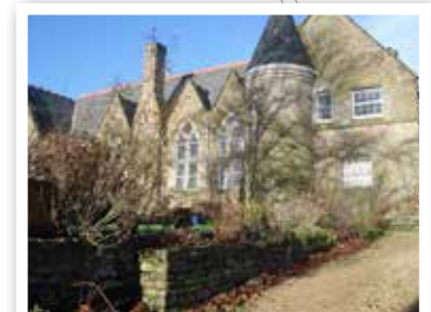
OLD INFANT SCHOOL