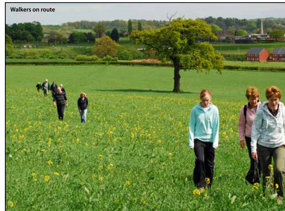
Walkers on route

Note: Due to the terrain, nearly all our walks involve at least one short steep uphill and some stiles. However, you can take it as slowly as you like and the views make it worthwhile