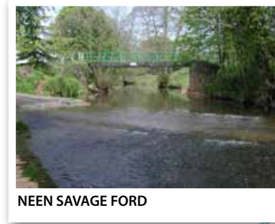
NEEN SAVAGE FORD