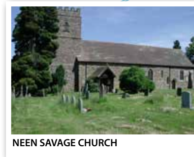
NEEN SAVAGE CHURCH