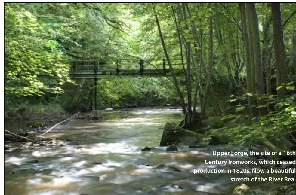
Upper Forge, the site of a 16th Century Ironworks, which ceased production in 1820s. Now a beautiful stretch of the River Rea.

Note: Due to the terrain, nearly all our walks involve at least one short steep uphill and some stiles. However, you can take it as slowly as you like and the views make it worthwhile.